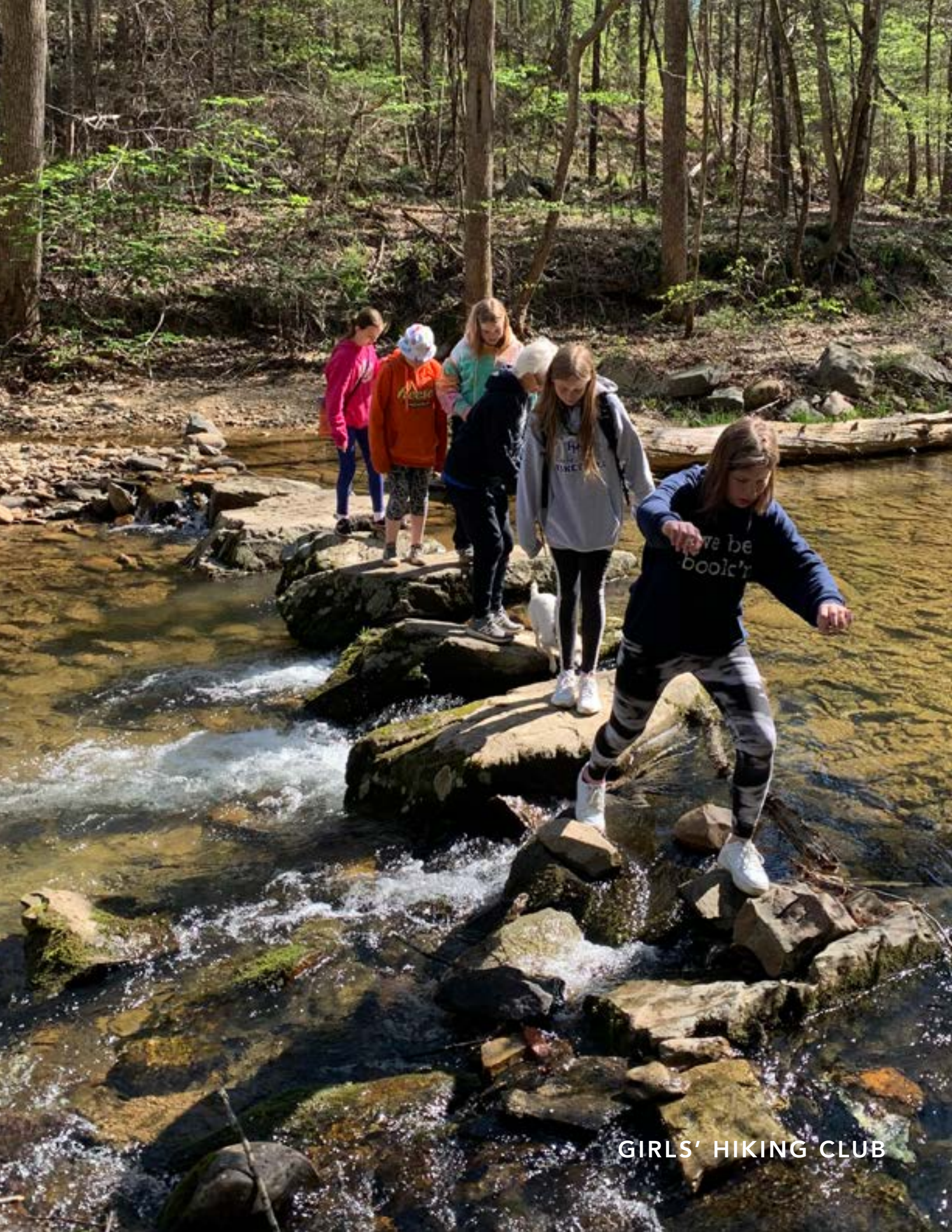
GIRLS' HIKING CLUB