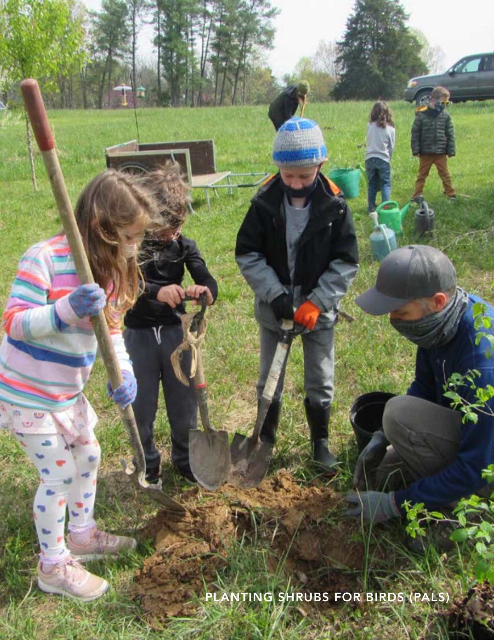
PLANTING SHRUBS FOR BIRDS (PALS)